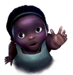
"Sulwe felt beautiful inside and out!" -- Lupita Nyong'o

As we come to the end of a busy half of term, it seems a good time to reflect on our achievements in all their forms.